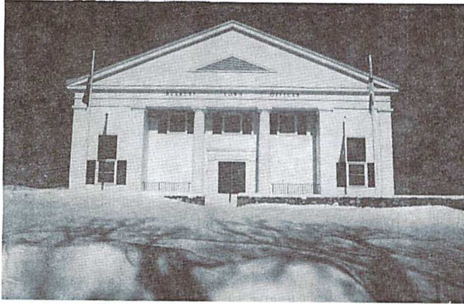
Duxbury Town Hall was closed for 2 days.